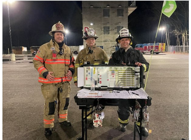
UConn Fire Dept. along with mutual aid partners, conducted live fire training together at Eastern Fire School. The Command Team utilized a new incident command board recently acquired by UConn Fire Dept with great success.

The UConn FMU continues to work with Residential Life updating the On-Campus Housing Contract to ensure students are informed of fire safety requirements and expectations. The following is an excerpt from the On-Campus Housing Contract, which all residential students are responsible for: