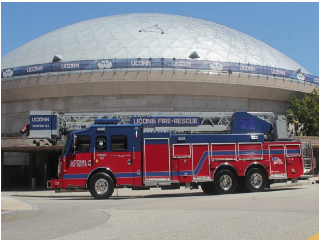
UConn Fire Department 2018, 103-foot tower ladder

For questions about the Fire Log or for access to Fire Logs older than 60-days, please contact the Clery Compliance Coordinator at 860-486-4800.