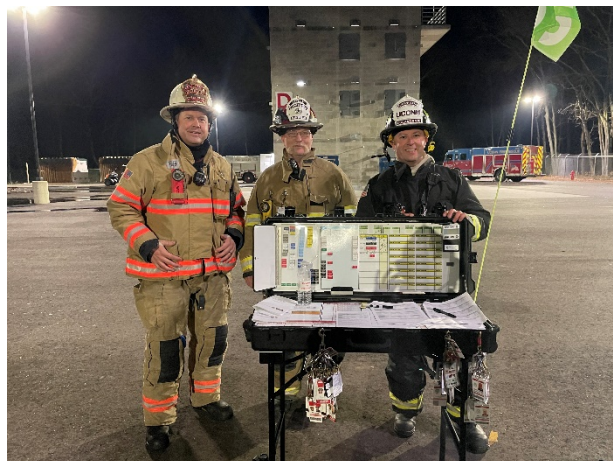
UConn Fire Dept. along with mutual aid partners, conducted live fire training together at Eastern Fire School. The Command Team utilized a new incident command board recently acquired by UConn Fire Dept with great success.

In 2023, the University developed and implemented a new policy restricting Lithium-ion Battery Powered Motorized Personal Transportation Vehicles within University Owned and/or Managed Buildings. This policy applies to all University students, staff, faculty, and visitors, and University-owned and/or managed buildings across all campuses and is enforced by the UConn Fire Marshal Unit/Fire Department, with the assistance of Facilities Operations.